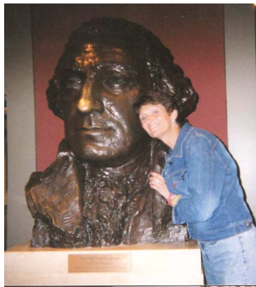
GRACI FALLS IN LOVE WITH A OLDER GUY