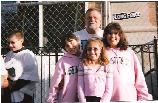
BUCK & THE PINK GIRLS