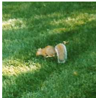
I GOT A PICTURE OF A SQUIREL