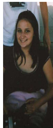
A MOVIE STAR