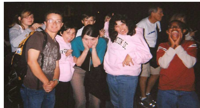
THIS IS A SCARY GROUP!