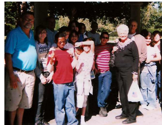
WOULD YOU GIVE THIS GROUP A RIDE?