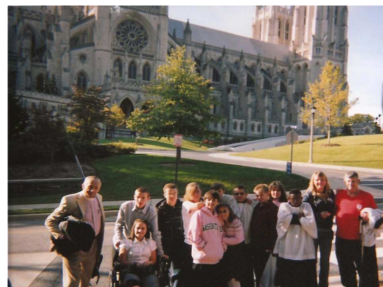
OUR BIG DAY AT THE CATHEDRAL