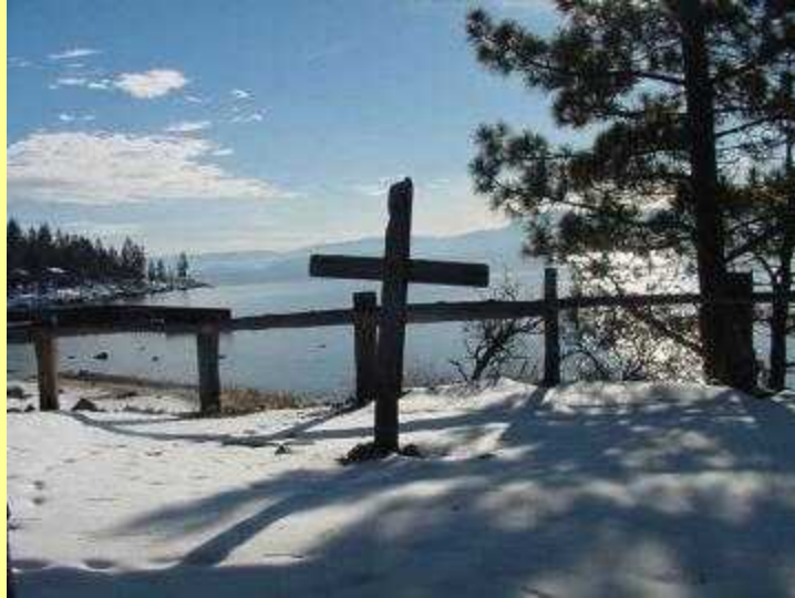
The Prayer Point at Camp Galilee